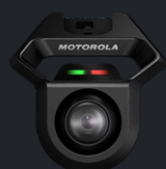
M5F FRONT CAMERA