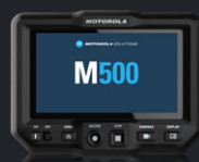
M5D CONTROL PANEL