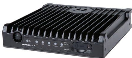
VML750 LTE Vehicle Modem