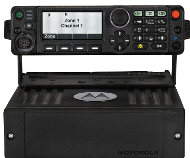
APX 8500 All-Band Mobile Radio