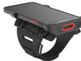
The CT37 Wearable solution for a hand-free experience