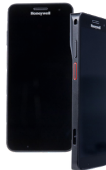
The CT37: 5G mobile computer on the Mobility Edge™ platform, elegant, slim, powerful, durable, and easy to use.

The CT37 also comes with the latest 5G and Wi-Fi 6E technology to stay connected in both indoor and outdoor environments. 5G offers the highest bandwidth and lowest latency available for mobile frontline workers. Whether you are on a private 5G or CBRS network, or a Wi-Fi 6E environment, your networks can continue their workflows with reliable uptime.