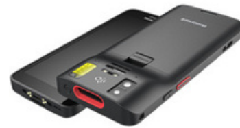
The CT37: 5G mobile computer on the Mobility Edge™ platform, elegant, slim, powerful, durable, and easy to use.

The CT37 arrives with a complete set of accessories, including Universal Dock charger which can be field upgraded by the end user without tools to support multiple Honeywell field mobility computers now and in the future. Other accessories include standard and extended battery, scan handle, and RFID reader handle for fast cycle counting and ruggedizing boot.