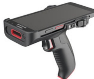
CT37 with scan handle